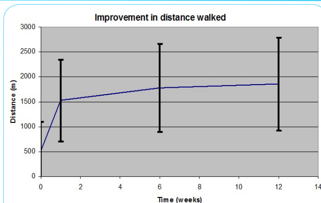
Figure 1. Change in distance walked (mean and Standard Deviation) in meters (m) after starting Nordic Walking. There was a significant improvement in distance walked in meters (m) which started in the first week after starting Nordic Walking ( p < 0.001 ) and continued throughout the 12 weeks.

There were 52 females and 48 males. The mean age of the participants in the study was 75.4 \pm 7.7 years (range 60-100). The pain on walking had been present for a mean of 11.7 \pm 13.2 years (range 0.5-60 years) before starting NPW (Table 1, Figures 1 and Figure 2).