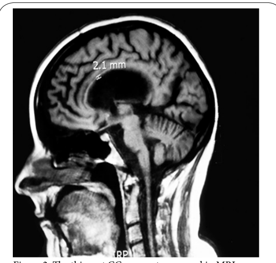
Figure 2: The thinnest CC segment measured in MRI scan.

and Northeast Lincolnshire in UK (Total population 329420 in 2015). There are two outliers (Age 18 & 87) in the Sample Frame and they are excluded to match the Sample. Sample Frame is now 365. Mean age of Sample Frame is 55.56 as shown in the Age Distribution Graph. Maximum Prevalence is between 50 to 59 years. Female to Male ratio of Sample Frame is 2.04 [6,7].