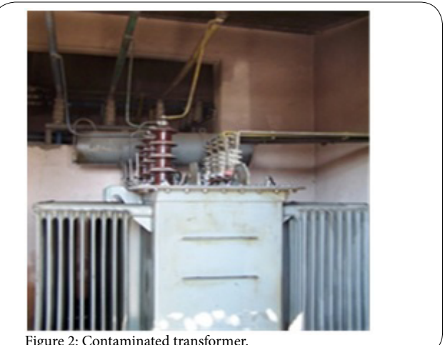
Figure 2: Contaminated transformer.

PCB-containing transformer from which sample 1 was taken is located in electricity generating facility (power plant) in unincorporated. The transformer can be seen in Figure 2. The owner of the PCB-transformer must take measures as soon as practically and safely possible to contain and control any potential releases of PCBs. In any case the newly-identified PCB Transformer immediately registers in the national database and must be disposed of in a carefully controlled manner in accordance with regulations administered by Ministry of Environment and Urbanization (MEU).